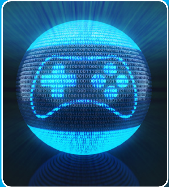
Video Game Design and Development

Creating Mobile Apps Interior Design Intro to Guitar Mastering Your Digital SLR Camera Scrapbooking Start Your Own Edible Garden World Literature and Composition