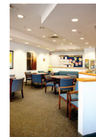
Lobby and Sitting Area