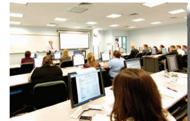
Computer Class Room